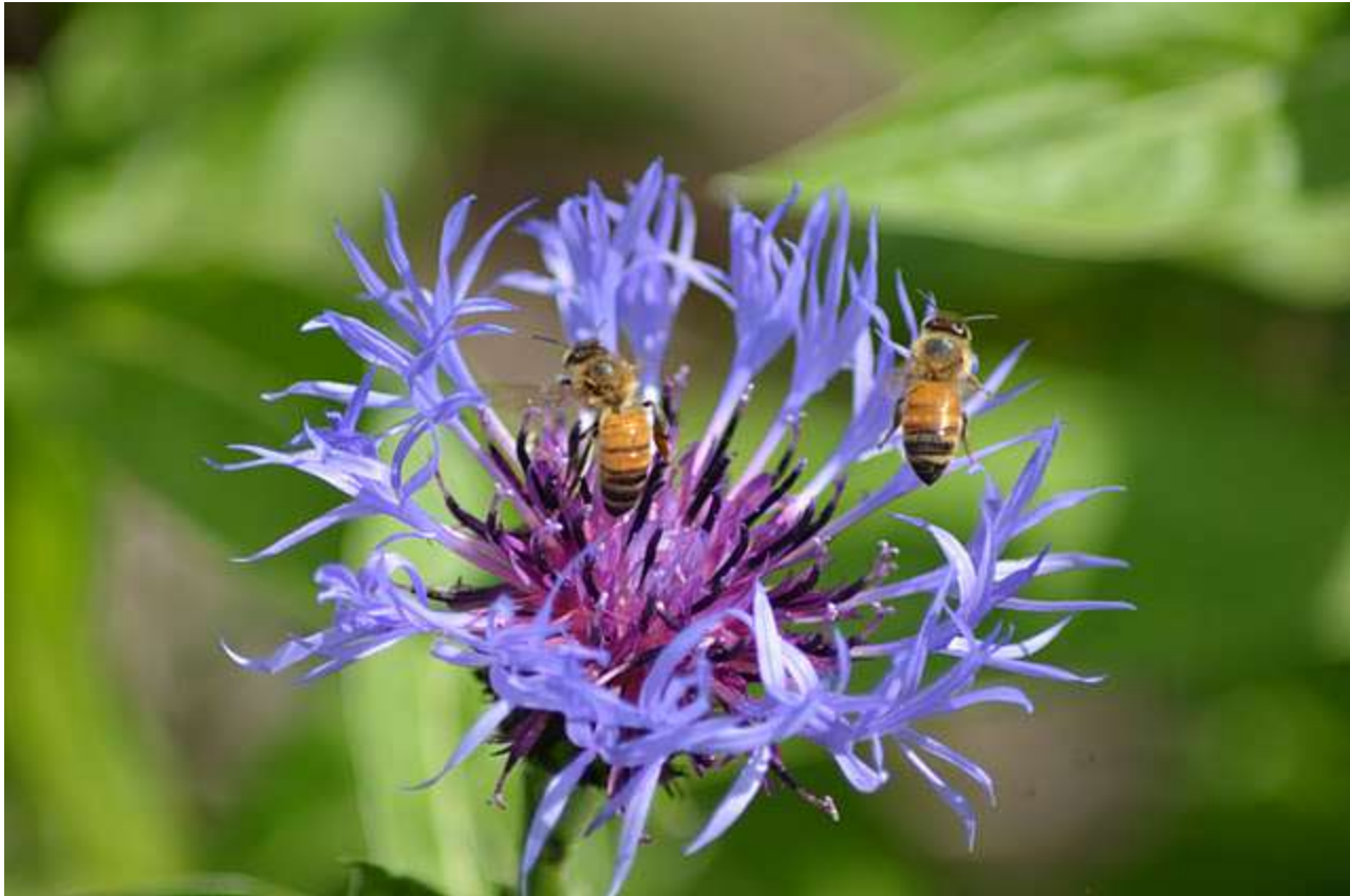
Bachelor button or cornflower